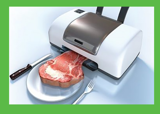
Genetically Modified & 3D Foods

Alternative food sources will play a big part in securing future food. Some possible options being reasearched are: 3D Printing, Genetically Modified Food, Insect Farming, and New Farming Methods for growing produce.